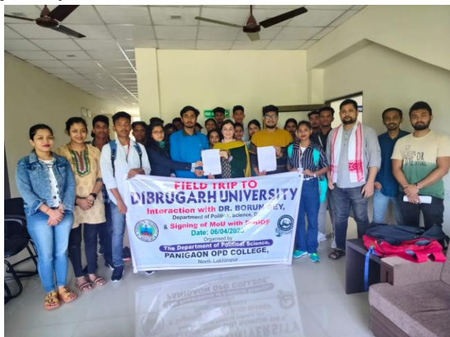
MOU with DUDQF, DU