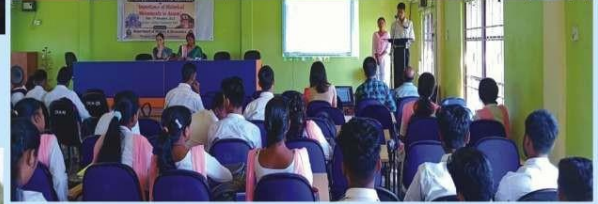
INTER DEPARTMENTAL SEMINAR ON "Importance of Historical Monuments in Assam " Organised by Department of History & Economics Panigaon OPD College, Lakhimpur Date: 5 Nov. 2022 Venue: College Conference Hall. 5 nov.