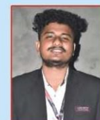
GENERAL SECRETARY LAKHI DUTTA