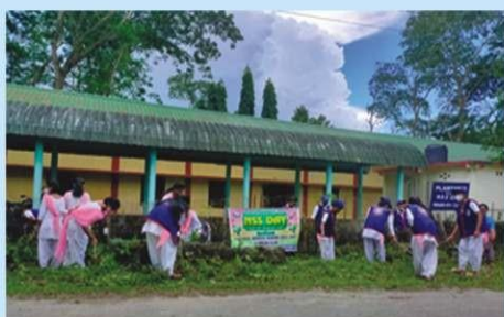
Observed NSS Day, Plantation Programme on 24th Sept'2021