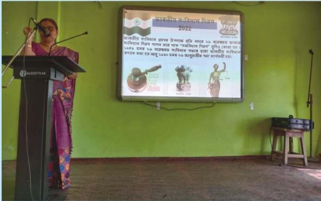
Constitution Day observed at Panigaon OPD College, Organised by Legal Literacy & Electoral Literacy Club on 26 nov., 2022