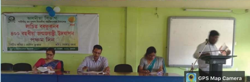
Celebration of 400th Birth Anniversary of Lachit Borpuhan Day-5 A glimpse of Assamese poetry recitation competition organised by Department of Assamese on the occasion of Lachit Borpuhan's 400th Birth Anniversary at Panigaon OPD College.(23/11/2022)