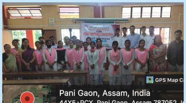
Celebration of 400th Lachit Divas, DAY- 1 (19th Nov. 2022) ESSAY WRITING COMPETITION ON LACHIT BORPHUKAN Organised by NSS UNIT & DEPT. OF HISTORY, Panigaon OPD College.