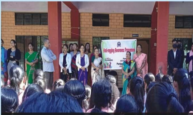
Anti- Ragging Awareness Programme, Organised by Anti- Ragging Squad, Panigaon OPD College, Lakhimpur on 1st December, 2022