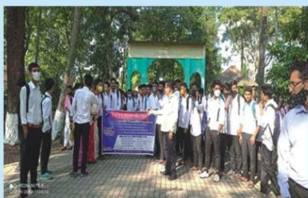
Voters Awareness Abhijan, 2020