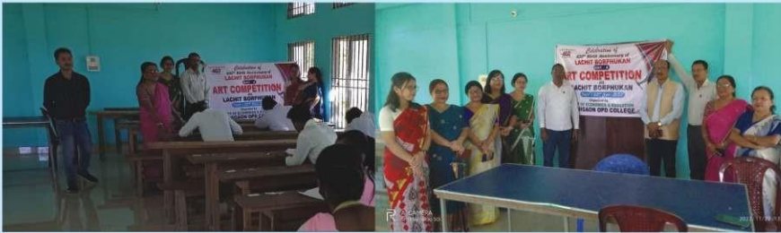
Celebration of 400th Birth Anniversary of Lachit Borpuhan Day-4 (22/11/2022) An Art Competition as 4th Day Programme Organised by Department of Economics and Education, Panigaon OPD College, Lakhimpur on 22 Nov' 2022