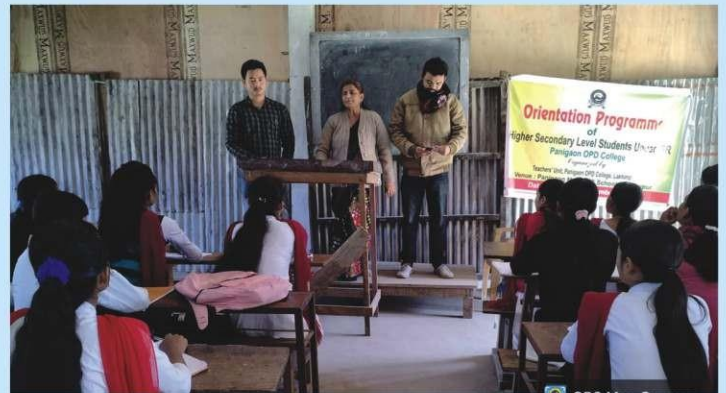
Two days Orientation Programme at Panigaon HS School organized by Teachers' Unit, Panigaon OPD College, Lakhimpur on 5th and 6th Nov. 2022.