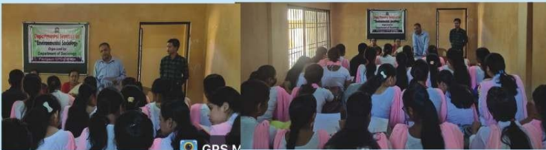
Intra Department Seminar on "Environmental Sociology" Organised by Department of Sociology Panigaon OPD College on 31 Oct., 2022.