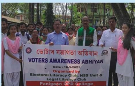
Voters Awareness Abhijan, 2021