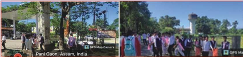
Cleanliness Drive as a part of "Clean India Campaign" Organised by NSS Unit, Panigaon OPD College, Date: 29 Oct. 2022