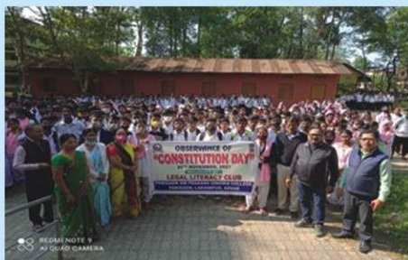
Observance of Constitution Day