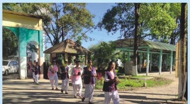
Celebration of 400th Birth Anniversary of Vir Lachit Day-2 (20/11/2022) A Plantation Programme Organised by NSS Unit and Yuva Tourism Club, Panigaon OPD College