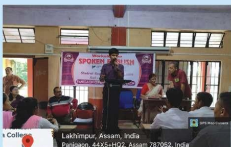
Workshop on 'Spoken English' Organised by Student Support and Progression Sub- Committee, IQAC, Panigaon OPD College, Lakhimpur. Date : 13 Oct. 2022