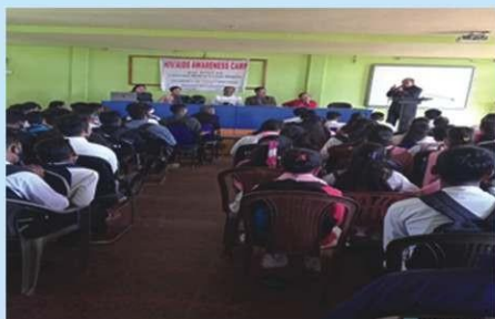
AIDS Awareness Camp, 2019