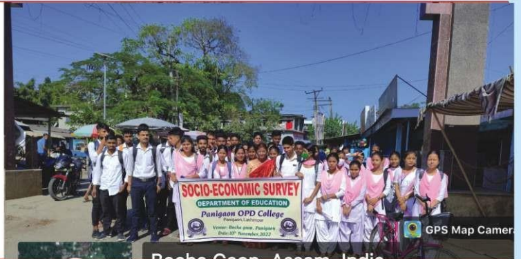
A SOCIO- ECONOMIC SURVEY Organised by Department of Education Panigaon OPD College, Date- 10 November 2022