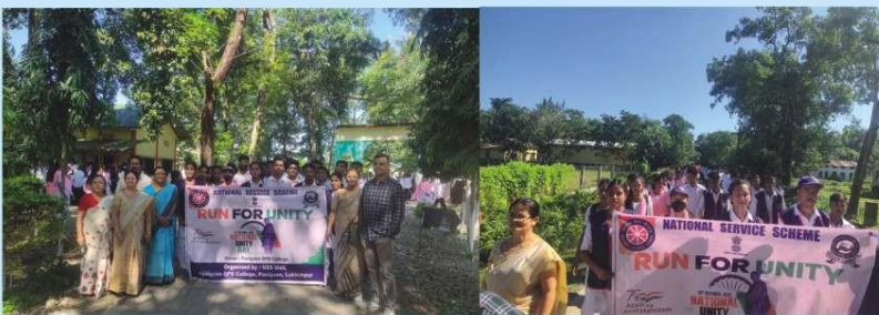
Celebrated National Unity Day - Run for Unity and Pledge Taking Ceremony Organised by NSS Unit Panigaon OPD College, on 31 Oct., 2022

পানীগাঁও ওম প্রকাশ দিবোদীয়া মহাবিদ্যালয়ৰ আন্তঃ মহাবিদ্যালয় বচনা প্রতিযোগিতাৰ ফলাফল ঘোষণা।