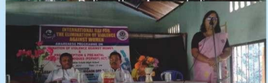
Awareness programme on Elimination of violence against women & Pre-Conception and Pre-Natal Diagnostic Techniques (PCPNDT) Act, 1994. On the occasion of International Day for Elimination of violence against Women, 25 November,2022 at Dakhin Telahi High School, Lakhimpur Organised by Legal Literacy Club, Panigaon OPD College, Lakhimpur in Collaboration with District Legal Service Authority, Lakhimpur & Telahi ICDS Project, NLP