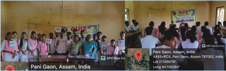
Intra Department Quiz Competition Organised by Department of Education, Panigaon OPD College, on 20 Oct., 2022