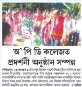
Celebration of 400th Birth Anniversary of Lachit Borpuhan Day-5 (23/11/2022) A competition cum exhibition on DIY from Waste Materials was organised by the Department of Political Science and Philosophy on 23/11/2022