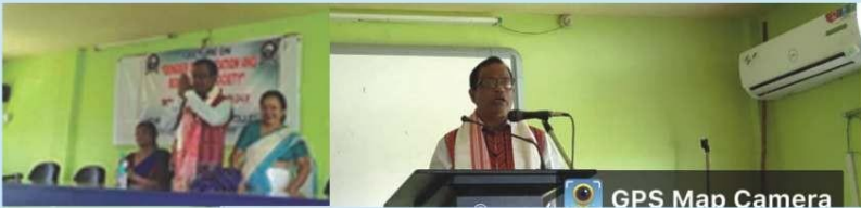
A Lecture on "Gender Sensitization and Role of Civil Society" Organised by Department of Sociology in collaboration with IQAC, Panigaon OPD College, 22 Oct., 2022.