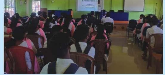
To mark the 400th Birth Anniversary of Lachit Borpuhan, A documentary displayed in the conference hall of Panigaon OPD College, Lakhimpur. The programme was initiated by IQAC, POPD College on 25/11/22