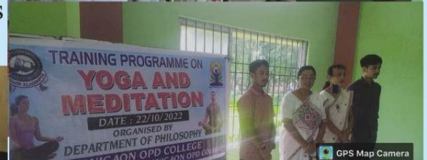
Departmental Training Programme on "Yoga and Meditation "Organised by Department of Philosophy, Panigaon OPD College, on 22 Oct., 2022