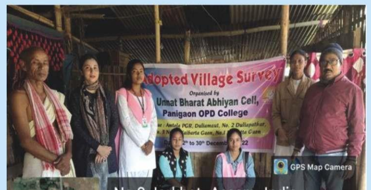
Household Survey under Unnat Bharat Abhiyan conducted at Amtola PGR. On 12/12/2022