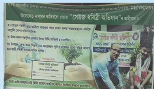
Seuj Dharitri Abhijan on 19th Aug, 2019