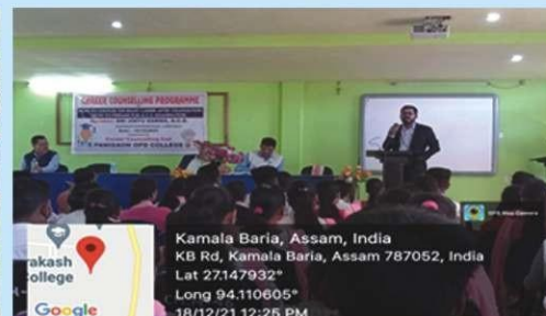
Carrier Counseling Programme