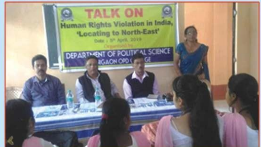
Talk on " Human Rights Violation in India, Locating to North -East" dated 5th April,2019